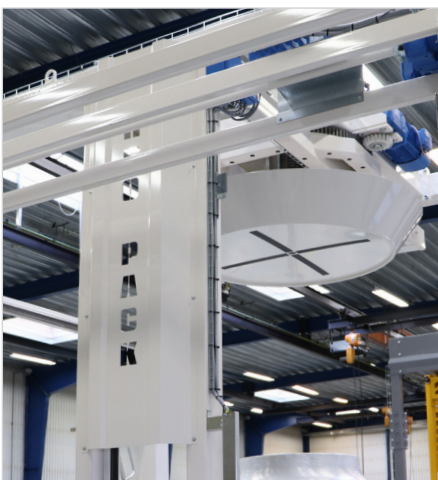
Swingarm and wheel ball bearing