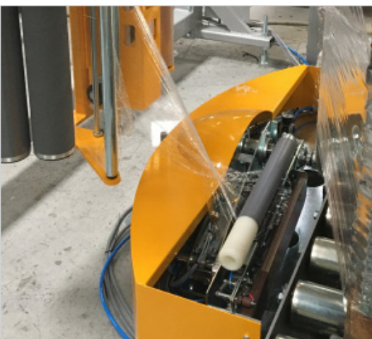
ISS welding module